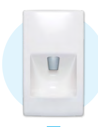
Compact Disabled Compliant Thrii See page 06