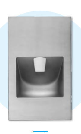
Stainless Steel Thrii See page 08