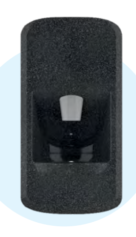
Solid Surface Thrii See page 10